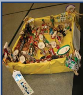
First place prize went to 'A Day at the Market', a group project of elementary school students from the Tucson International Academy.

CERCLL contributed to the Southern Arizona Language Fair, hosted by Partnership Across Languages (PAL), by sponsoring the culture display contest monetary awards. The Language Fair in promotes language instruction in K-12 contexts throughout Southern Arizona. It was held on April 4, 2009, at the University of Arizona campus and was attended by over 2000 K-12 students, teachers, families, and other community members.